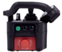
ADDITIONAL PANEL FOR COMMANDS